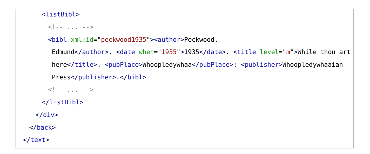
Example 51. Formally indicating the source for a quotation with @source.